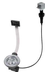
LIRA automatic waste fitting 8407 103